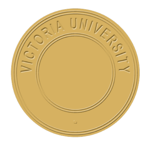
Given under the seal of Victoria University Australia.